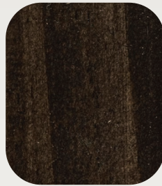
S7 - Ebony