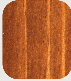
S3 - Cumaru