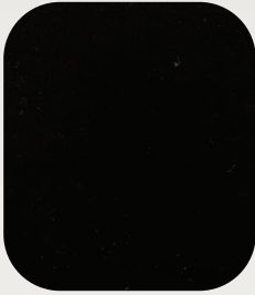
C7 - Jet Black

All colors are polyester powder coat paint. Custom color or RAL color available by request that meet the AAMA 2604 standard for 5-year Florida exposure.