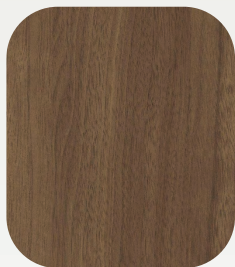
W1 - Walnut