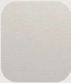
C2 - Light Silver