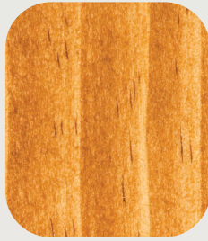
S2 - Teak