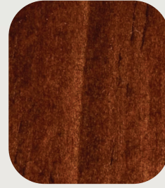
S4 - Ipe