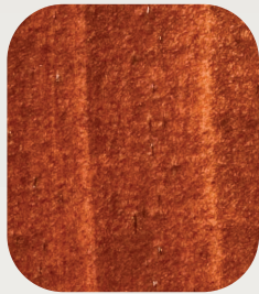
S5 - Jarrah