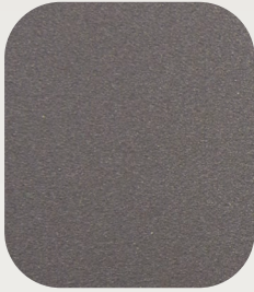
C5 - Slate