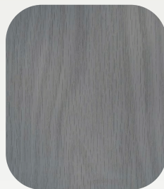
W3 - White Oak - Gray Wash