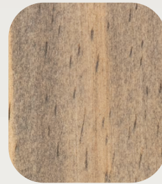
S8 - Weathered Grey

All colors are shown on Accoya® wood. Finishes are a four-step application of stain and clear matte top coat. UV inhibitors and mildewcides are included providing superior longevity.