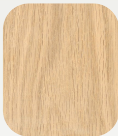
W2 - White Oak