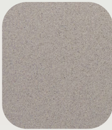
C4 - Speckled Silver