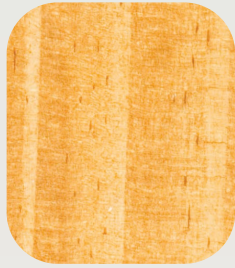
S1 - Garapa