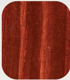
S6 - Mahogany