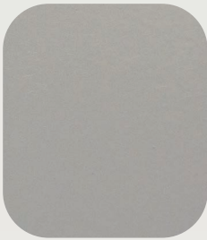
C3 - Grey