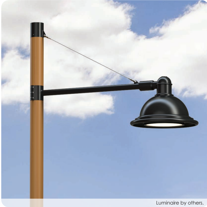
Luminaire by others.