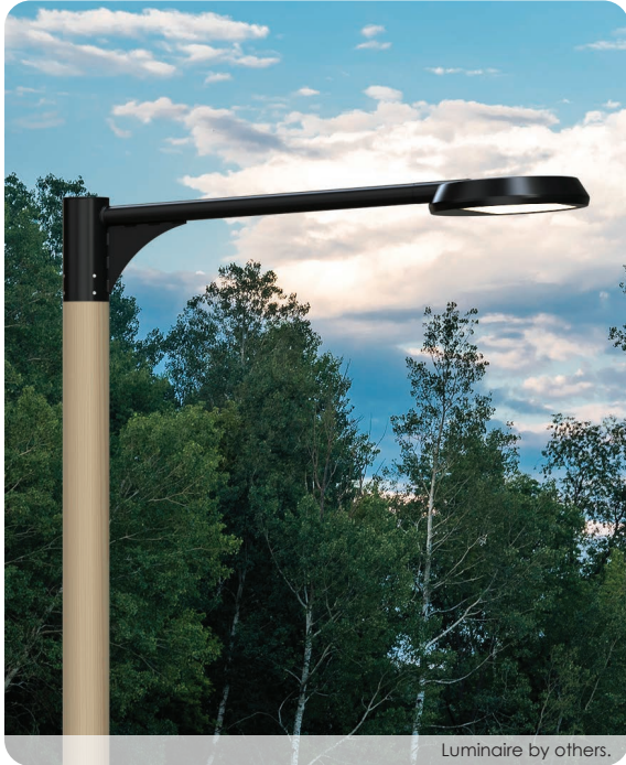
Luminaire by others.