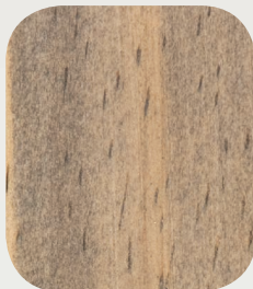
S8 - Weathered Grey