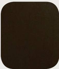
C6 - Bronze