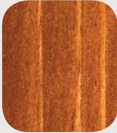
S3 - Cumaru