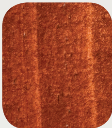
S5 - Jarrah