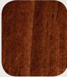
S4 - Ipe